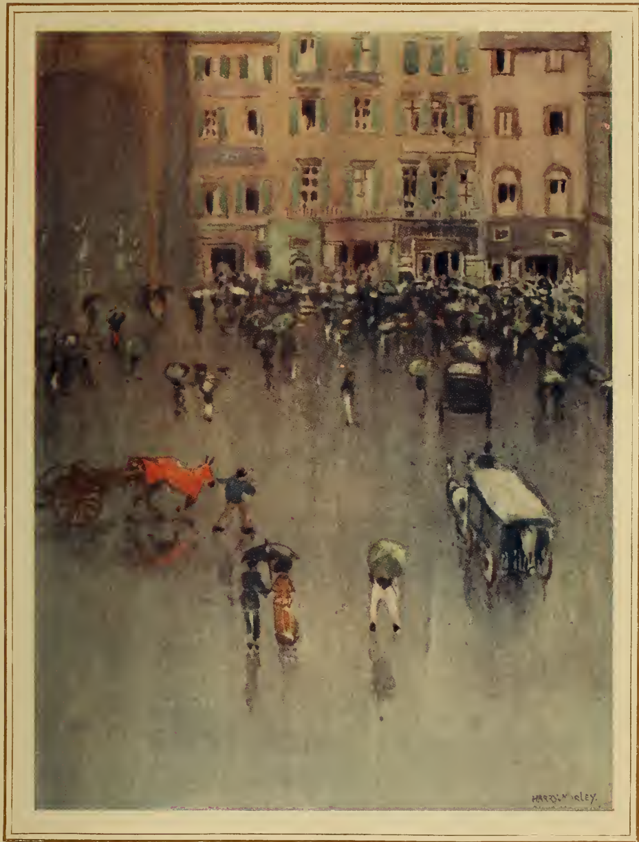
THE PIAZZA DELLA SIGNORIA ON A WET FRIDAY AFTERNOON